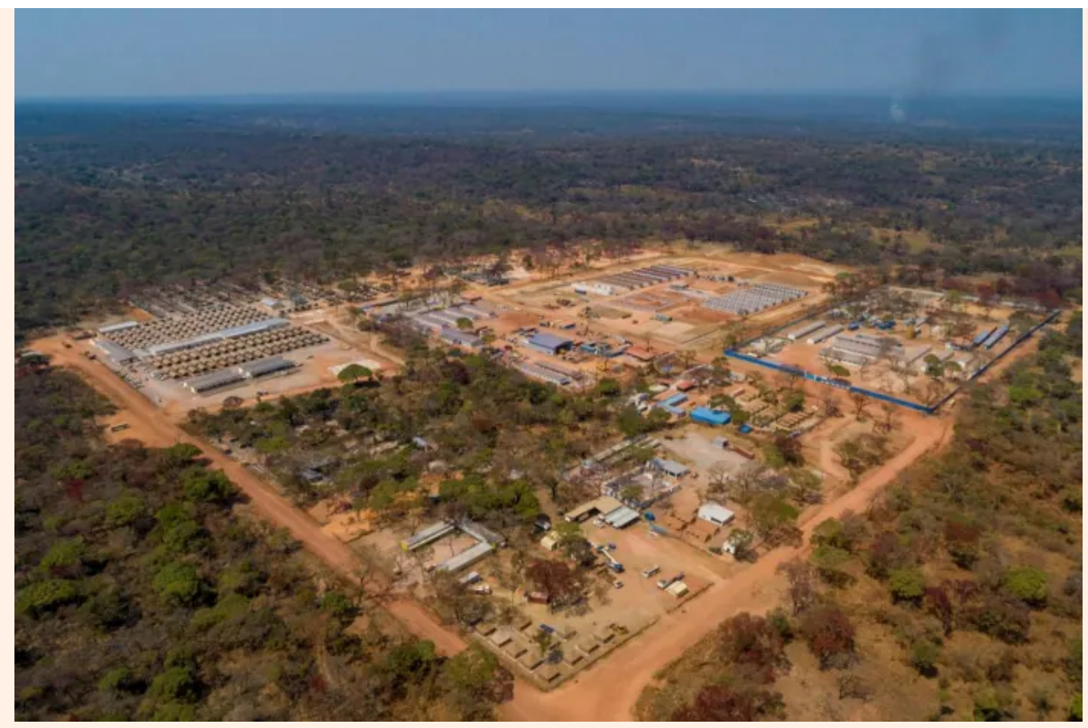
The Kamoa-Kakula copper project in the Democratic Republic of Congo

"People look at the supply numbers, but they don't filter in how difficult it is to get that supply," says Farid Dadashev, co-head of European metals and mining at RBC Capital Markets. "The last time the copper price was high in 2011 and 2012 there were a couple of new projects in the market but they were all delayed and the capital expenditure was extremely high."