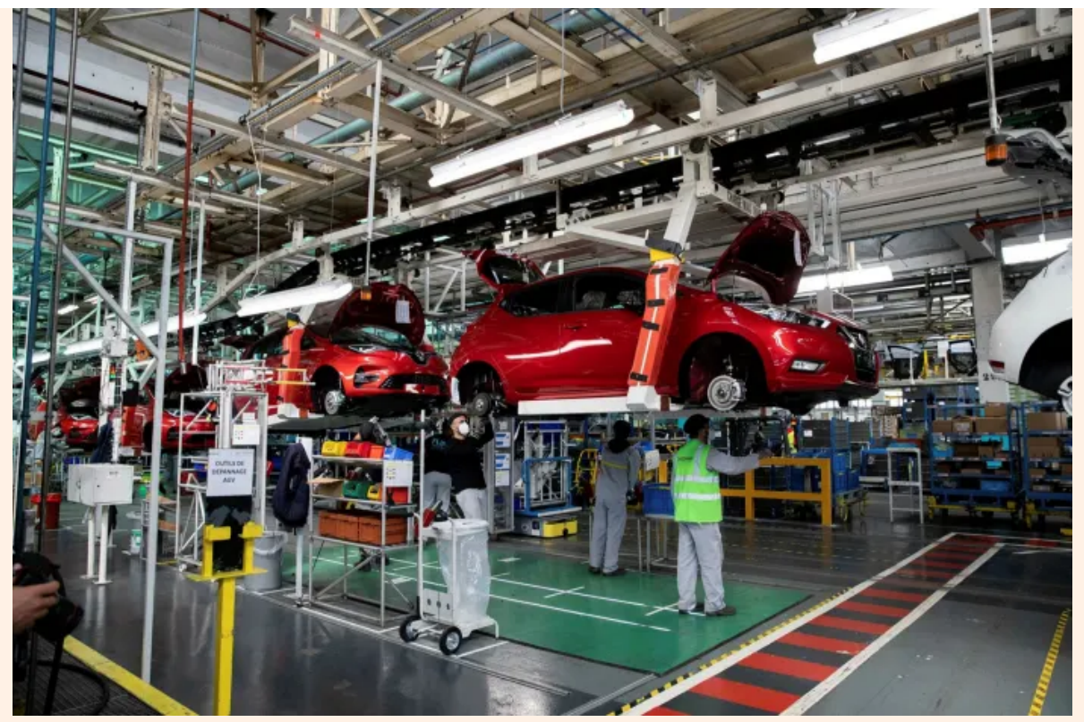
An electric vehicle contains five times more copper (60-83kg) than a car fitted with an internal combustion engine, according to Goldman Sachs

"That's why we say it is as strategically important as oil, because if you want to decarbonise transport and industrial fuels through electricity, you are going to need copper," he adds, "and a lot of it."